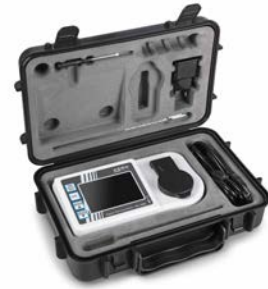
Transport and storage case