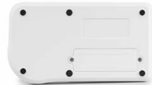
Rear view, screw-on battery compartment cover