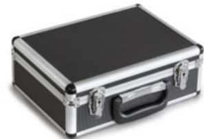
Transport and storage case ORA-A1102