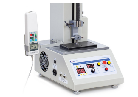
Solid and flexible fixing options for many clamps and accessories from the SAUTER product range, see accessories