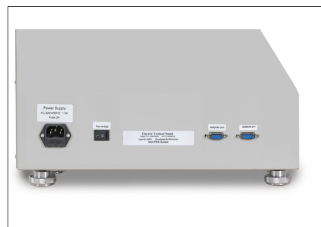
Interface for data transmission from the SAUTER FH measuring device and for controlling the test stand with SAUTER AFH software