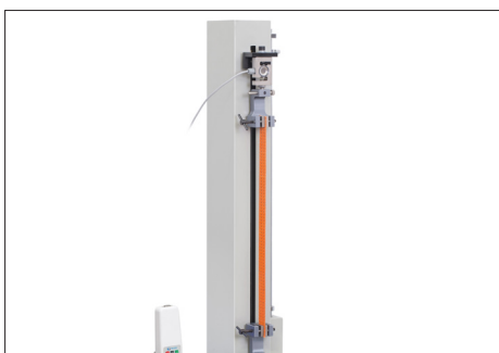
A wide range of application possibilities because of its large travelling distance