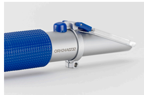
NEW: now with engraved serial number