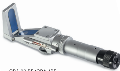
ORA 90 BE/ORA 1RE