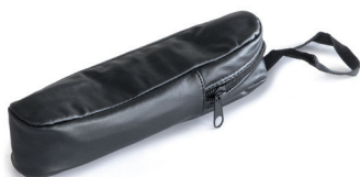
Leather bag ORA-A2103