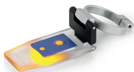
Prism coverplate with LED ORA-A1101