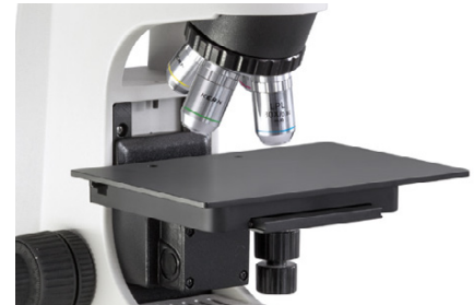
Stage and objectives