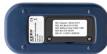
Rear view, screw-on battery compartment cover