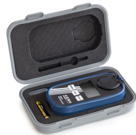
Transport and storage case