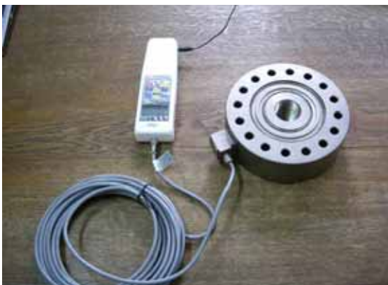
Picture of the complete unit

Central fixture for the tension or compression attachment Size: M 42 x 2